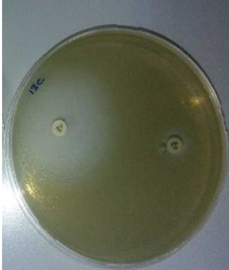
Figure 1. CDT inhibition zone of the phenotypic sensitivity test.