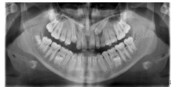
Figure 2 Panoramic image showing unilateral impacted canine in maxilla of a male patient.

Knowledge of dental anomalies in patients is fundamental for treatment planning [28]. Different prevalence was reported among different ethnic groups [2]. Ethnic background of the sample may result in higher or lower rates of some anomalies [4]. Traits that may occur more commonly in certain ethnic groups may be considered specific to that population [3]. According to Stecker et al. [1], dental practitioners who are aware of ethnic differences in the occurrence of dental anomalies will be more