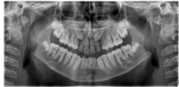
Figure 1 Panoramic image showing bilateral impacted canine in a female patient.

There were five right and seven left impacted maxillary canines, while there were two right and two left mandibular impacted canine teeth. Of all patients, two impacted canines were bilateral (Figure 1), whereas 14 were unilaterally impacted teeth (Figure 2). No significant difference