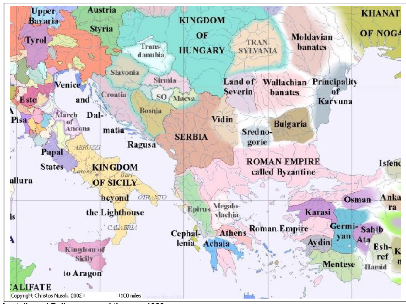
Anatolia and Balkans around the year 1300

The Ottoman conquerors believed that no conquest could stand without the goodwill of the general population of the conquered, so military campaigns were remarkably fair and easy on the average person.