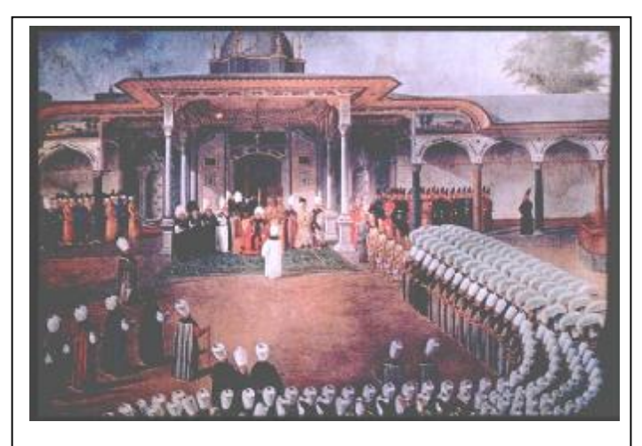
A view of the Ottoman Court remarked by its "order"

Ottoman state was unique in that it lacked an aristocracy and was run by men chosen for their merit and wholly loyal to the sultan. For some contemporary Europeans it seemed as an admirable feature while others believed that the absence of an aristocratic check upon the sultan led to what came to be termed "oriental despotism".