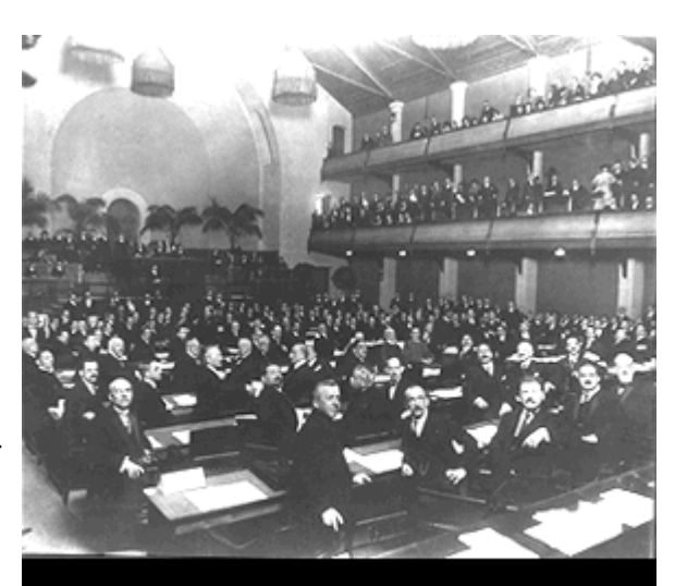
The opening session of the League of Nations, Geneva, Switzerland, 15 November 1920.

The League of Nations was founded immediately after the First World War. It originally consisted of 42 countries, 26 of which were non-European. At its largest, 57 countries were members of the League. The League was created because a number of people in France, South Africa, the UK and the US believed that a world organization of nations could keep the peace and prevent a repetition of the horrors of the 1914-18 war in Europe. An effective world body now seemed possible because communications were so much better and there was