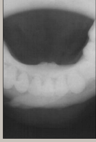
Figure 2. Cephalometric radiography helps pinpoint tooth.