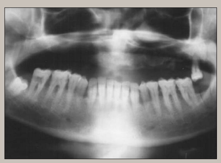
Figure 1. Orthopantographic exam shows presence of tooth.

teeth and oral hygiene was poor. No edema or any soft tissue defect was present.