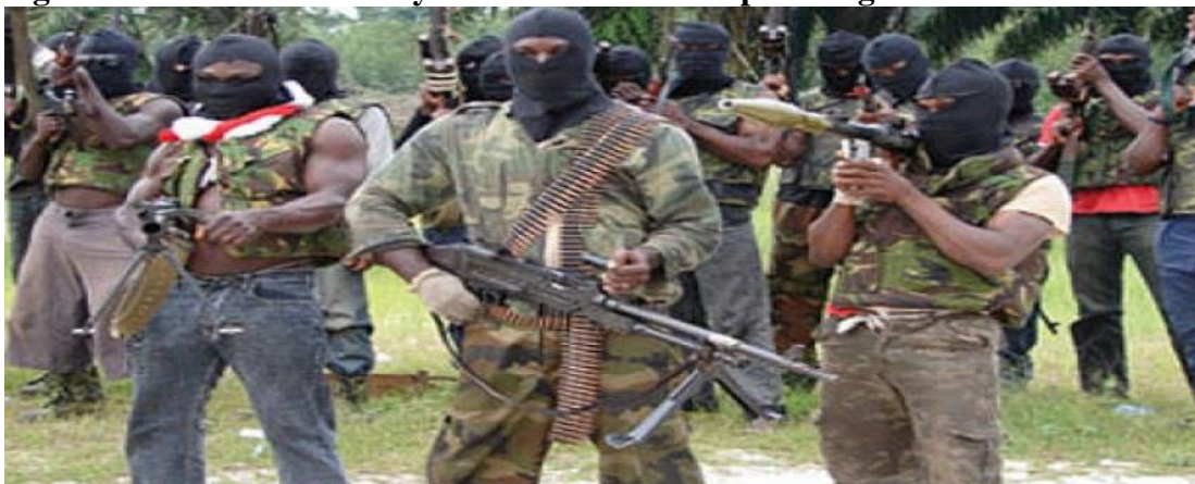
Figure 2.1 Picture of Heavily Armed Militia Group During 2007