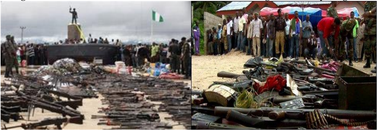
Figure 2.2 Pictures of Arms Recovered from Militants during the Amnesty Program