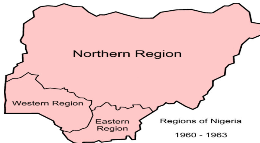
Figure 1.2 Map of Nigeria Showing the Three Regions from 1960 to 1963

During the colonial period, the core Niger Delta was part of the “Eastern Region” 21 . Eastern Regional Administration which came into being in 1951 is one of the three regions, under the British Colonial Empire of Nigeria.