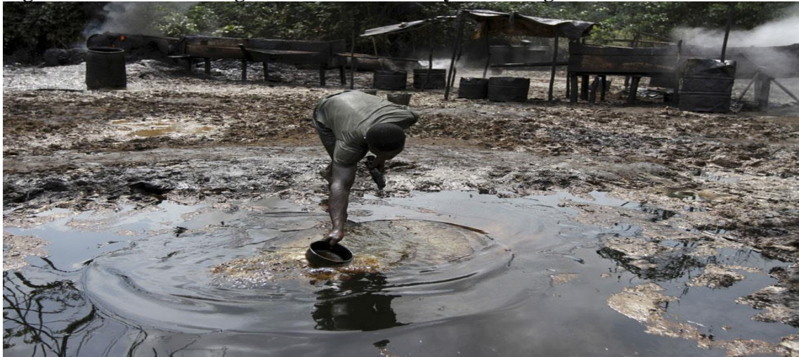
Figure 3.1 Picture of illegal Crude Oil Refinery in the Niger Delta

Source: Akintunde Akinleye, Reuters News, November 27, 2012. The young man in the picture is fetching crude oil from a storage pit into a locally constructed refining unit.