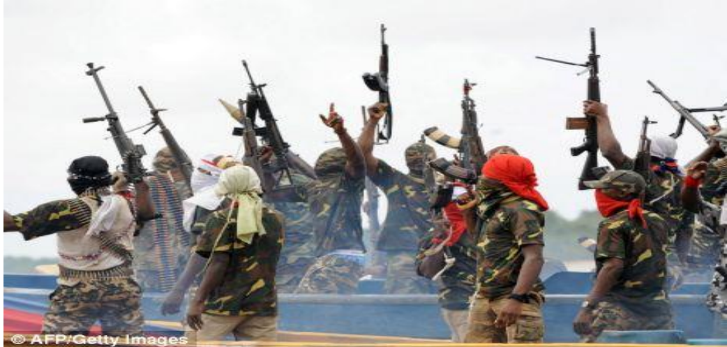
Figure 1.4 Picture of an armed group before the Amnesty