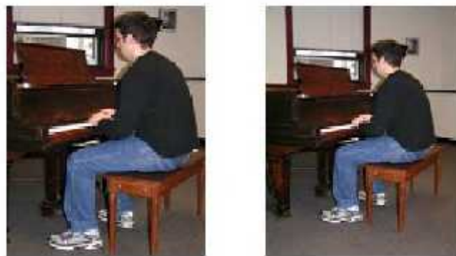
Figure 1: An example of Boundary Extension. Participants fail to remember exact scene and they remember as wider-angle than they are shown (Gallagher et al., 2005).

Boundary extension is tendency of remembering scenes with a wider-angle than they have been seen (Intraub & Richardson, 1989). Boundary Extension is not simply an error but also can be explained with the Anticipatory Nature of Representation meaning that humans and animals do not only get information with their sensorimotor neurons but also imagine their behaviors and plan for the future (Pezzulo, 2008). Boundary extension is indeed not a negative cognitive error. It is a consequence of how visual information is processed in our brain, so as to bring the input visual data together and create a coherent and continuous representation of the external world (Intraub, & Dickinson, 2008). Moreover, Boundary Extension is an instinctual phenomenon and it occurs at every age (Mullaly, Intraub, & Maguire, 2012). Figure 1.1 provides an example of boundary extension.