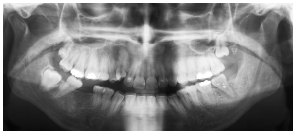
Fig. 1. Radiograph showing the periapical pathosis of the second left mandibular molar.

tomography (CBCT) findings to make a contribution to the clinical and radiological findings and differential diagnosis of FOP.