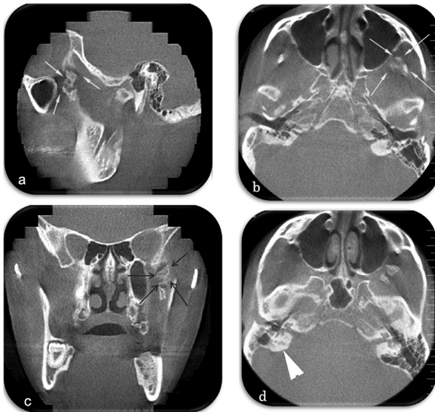
Fig. 2. a–c , Sagittal, axial, and coronal CBCT images show a radiopaque ossification under the left zygomatic arch through the skull base ( arrows ). The relationship between the surrounding muscles cannot be visualized on CBCT images. d , The axial image also shows marked opacification in the right mastoid region ( arrowhead ).

ing in FOP remains undetermined and further investigation should be conducted.